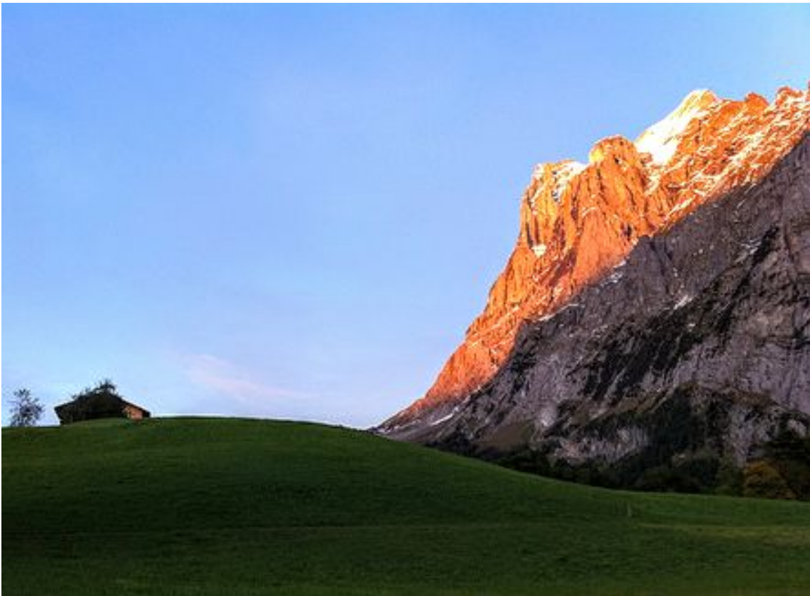
Approach to Grindelwald, Switzerland at sunset

Backpacker magazine selected Switzerland's Via Alpina as " The World's Best Hike " for 370 km of scenery, cheese, and chocolate. "Your first view of the Eiger massif will spoil you for the rest of your hiking days. The Via Alpina could offer nothing else and still be world-class. The chocolate, historic villages, on-time trains, and luxe hut system are pure gravy."