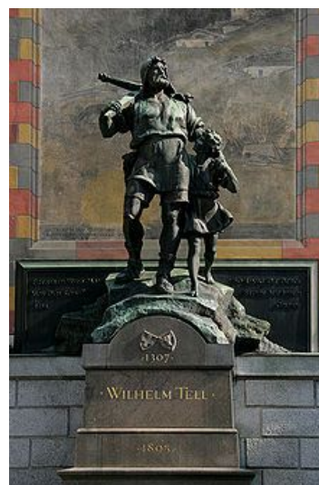
Wilhelm Tell Statue - Altdorf

You should have at least intermediate to advanced hiking skills. While no technical climbing is required, there are areas with narrow trails bordered by steep drop-offs: where appropriate there are steel cables for protection. We may use ladders bolted to the mountainside for short ascents of steep terrain.