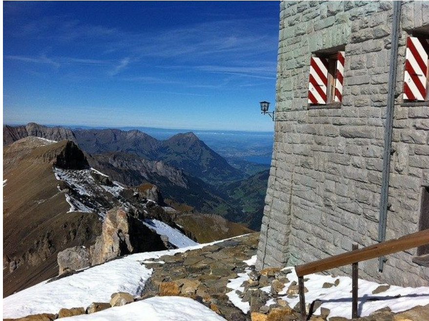
Blümlisalphütte overlooking Hohtürli pass, the highest on Via Alpina at 2,778m (in Part II)

Price is $2,500 per person shared occupancy for AMC members. Non-members can join for $50, and get the same price.