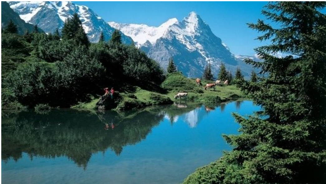
Descent from the Grosse Scheidegg

We will spend every night in either hotels or mountain huts. Blankets and pillows will be provided. Participants must bring a sleeping bag liner (sleep sack) to use instead of sheets. Accommodations are typically in a bunk room with 4–12 people of mixed gender. Mattresses are either side-by-side or in two-level bunk beds. Alternatively, we may sometimes have two persons (same sex) per room sharing two adjacent mattresses in a single bed frame.